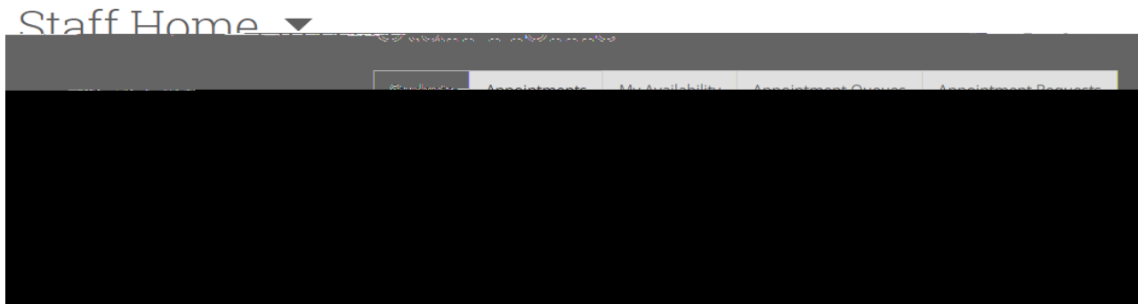
^^^ The new drop-down menus to assist with student lists and active term selection